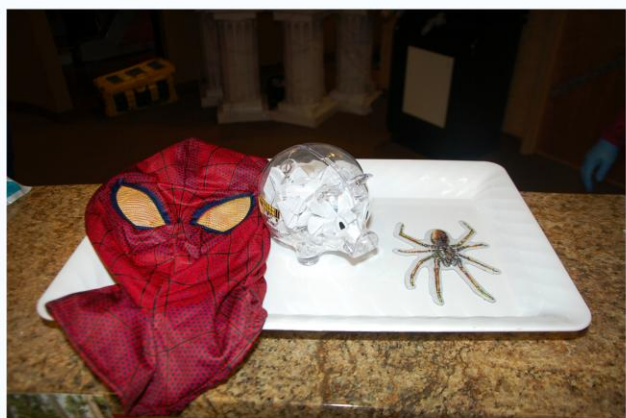
Spiderman mask with the token reward piggy bank.

The "Token Reward Program" is designed to encourage good orthodontic behavior and making life easier for both the patient and the doctor. When patients take good care of their teeth, they are automatically entered in the Token Reward Program via an entry form filled out with their Name and Birthdate. This entry form is kept anonymous, folded into a cute heart and guarded by Piggy Bank. Winners are drawn at the annual Halloween Open House, and prizes include a variety of dental care products to promote oral health. Good patients are valuable, and we believe in rewarding those who express good oral hygiene. After all, good oral habits lead to better health!