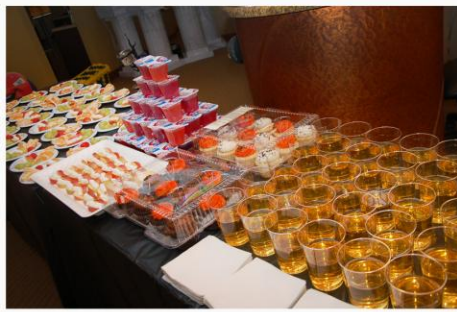
Oral-friendly treats and sugar free beverages are displayed for the neighborhood.