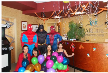
Team members of AllCare Orthodontic Center.