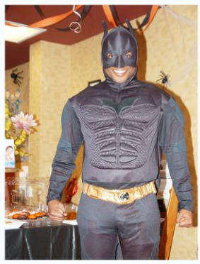
Winner of the Best Costume Contest (Batman).